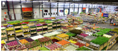
Floridata – Together strong by sharing data